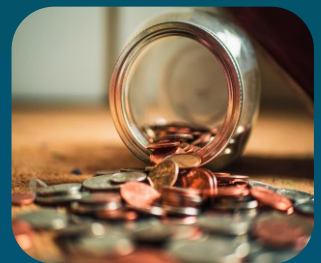
Independent Resource Audits